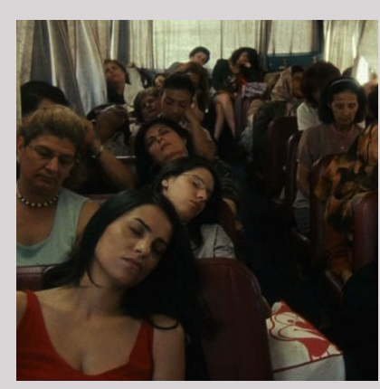
The Narrow Frame of Midnight

Tala Hadid Morocco, USA, France, Qatar, UK | 2014 | 93'